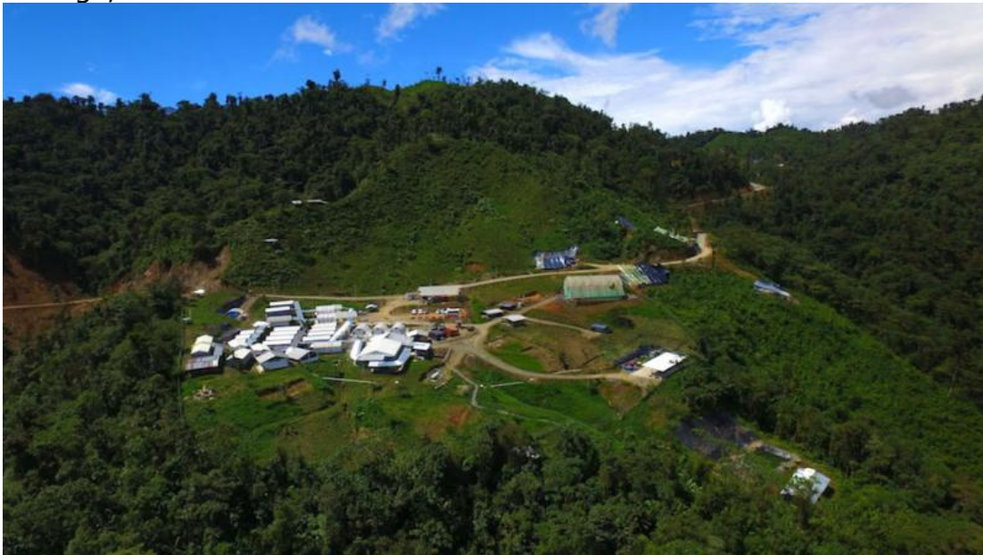
Aerial view of the main drilling camp targeting in/around the main Alpala Prospect at Cascabel