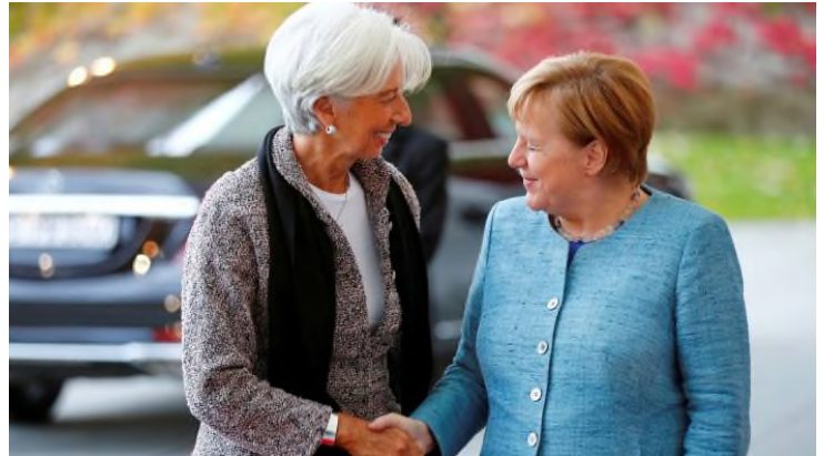
Monetary lame brain...and political lame duck

With the financial stress especially in the weaker nations (Italy front and center once more) the push has accelerated to completely “mutualize” Europe’s debt. This has largely been done in a de facto way already; now E.C.B. President Christine Lagarde (left in nearby photo) and others want to make it official. The pushback likewise is intensifying; especially in Germany where Chancellor Angela Merkel (right) is a lame duck finally—and mercifully—on her way out.