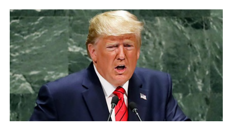
"China (has) declined to adopt promised reforms..."